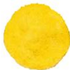
Plate 1. Photograph of Uranium Yellow Cake (U 3 O 8 )