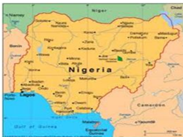
Fig. 1. Location map of Nigeria

The Tertiary-Recent volcanic rocks are found in Biu and Longuda plateaux, Jos Plateau and the Benue Trough. Though phosphate occurrences in Nigeria have been reported in four States such as Sokoto, Ogun, Edo and Imo (Tian and Kolawole, 1999; Ojo, 2003), in this paper the focus will be placed only on the first two mentioned occurrences because only the phosphate occurrences in Sokoto and Ogun States are in commercial quantities (Akinrinde and Obigbesan, 2006).